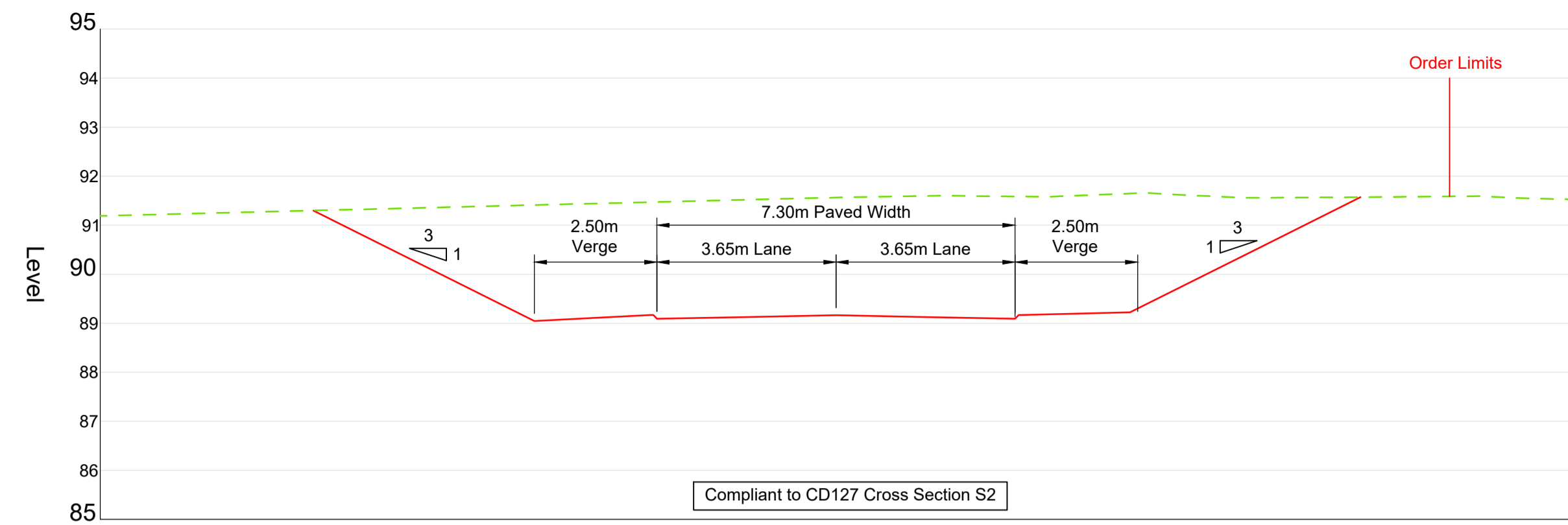
SECTION 05-D: Middleton Road Scale H 1:250, V 1:250. Datum 85.000